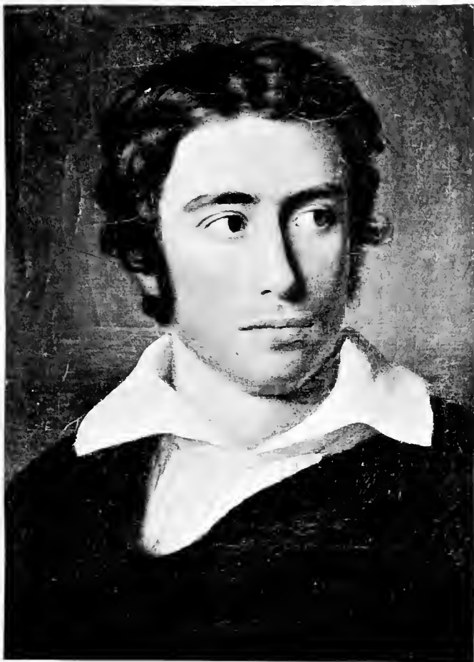
ANTON COUNT PROKESCH-OSTEN

From a painting by Turner (probably about 1830). In the possession of Anton Count Prokesch-Osten of Gmunden